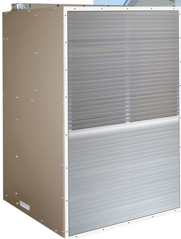
Comfort Pack Architectural Louver Grille (shown in anodized aluminum)