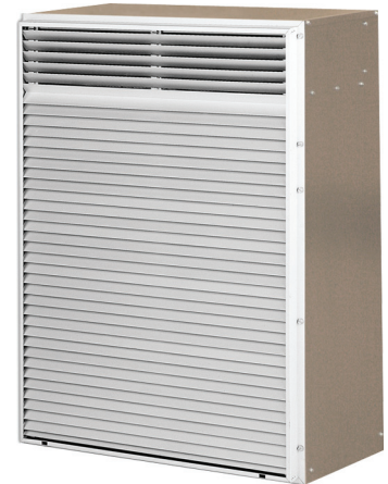
Split-System Architectural Louver Grille (3000 LG shown in anodized aluminum)

Architectural Louver Grilles add a pleasing appearance to any unit.